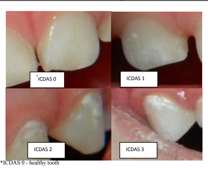
Figure 1. Active initial caries lesions in primary teeth by ICDAS II classification